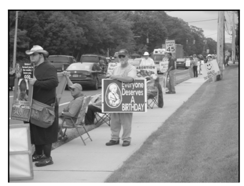
Pre-Independence Day Face the Truth Manorville 7/1/16 2017 date: TBA