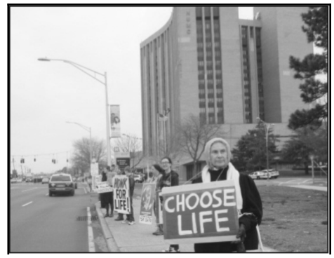
Good Friday Face the Truth at NUMC 3/25/16 2017 date: 4/14/17

Thanks to the many who answer the call, the many who join LICL in presenting a constant, visible, pro-life message through Nassau and Suffolk Counties.