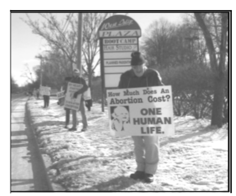
Love Them Both 2/13/16 W. Islip PP 2017 date: 2/17/17 Glen Cove PP