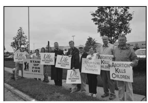
Stand Up For Life, Huntington 10/3/16 2017 date: 10/1/17