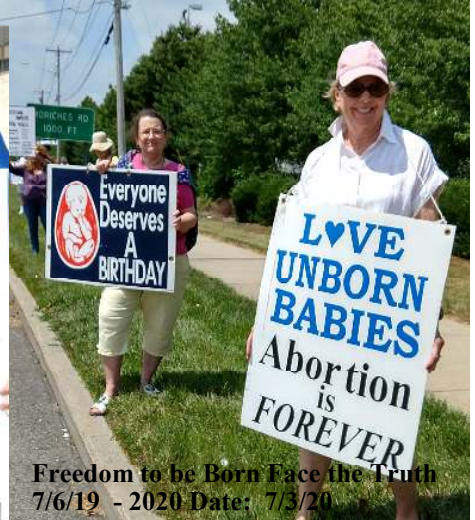
Freedom to be Born Face the Truth 7/6/19 - 2020 Date: 7/3/20