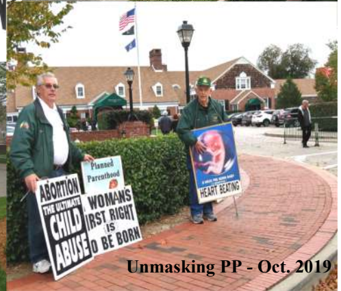
Unmasking PP - Oct. 2019