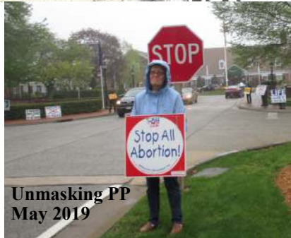
Unmasking PP May 2019

The LICL has also had a presence at many street fairs and other events; i.e., a demonstration at a "church" in Huntington that hosted a PP fund-raiser; Book Revue that featured a pro-abortionist author, etc. There are too many to feature here.