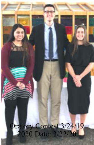
Oratory Contest 3/24/19 2020 Date: 3/22/20

The LICL has also had a presence at many street fairs and other events; i.e., a demonstration at a "church" in Huntington that hosted a PP fund-raiser; Book Revue that featured a pro-abortionist author, etc. There are too many to feature here.