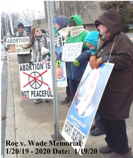
Roe v. Wade Memorial 1/20/19 - 2020 Date: 1/19/20

Thanks to the many who answer the call, the many who join LICL in presenting a constant, visible, pro-life message through Nassau and Suffolk Counties.