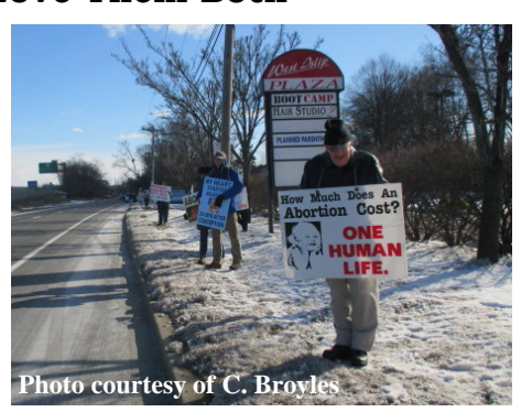
Stand Up For Life Huntington 2015

Feb.13, 2016 -West Islip. Several pro-lifers braved the cold to participate in this annual event sponsored by the LI Coalition for Life.