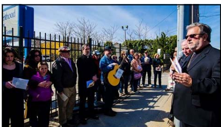
Holy Saturday 2014

Sat., April 4 10 AM in front of Planned Parenthood, 540 Fulton Ave., (Rt. 24), Hempstead. Sponsored by Cathedral Church