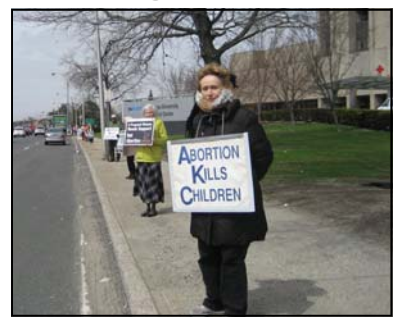
Good Friday 2014

April 3, 10:30 AM-Noon (rain or shine) Nassau University Medical Ctr., where abortions are committed. Prolife women, men and children stand in peaceful witness to the loss of children sacrificed by abortion at this hospital and