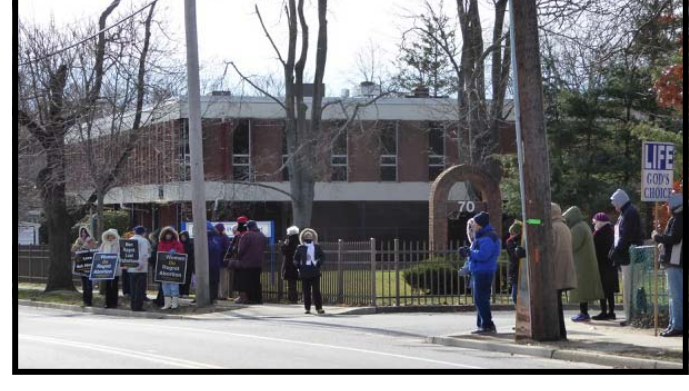
Prayer Vigil in front of Planned Parenthood, Smithtown on January 22, 2015.

Neither rain nor snow nor sleet nor hail - no we aren't talking about the USPS, we're talking about the dedicated pro-life people around our Nation and those shown in the photos below.