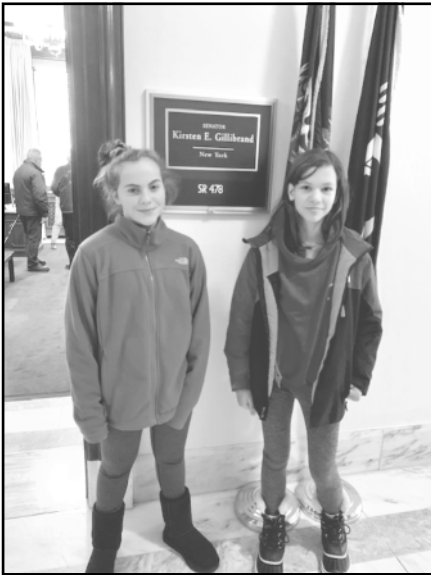
Youth from St. Philip Neri, Northport