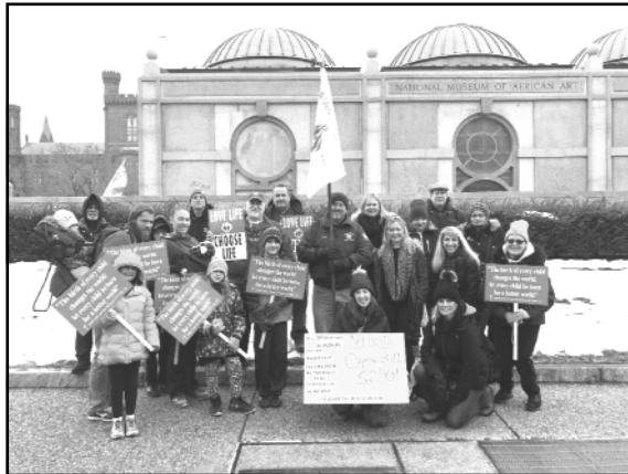
Our Lady of the Snows, Blue Point w/ neighboring parishes & groups