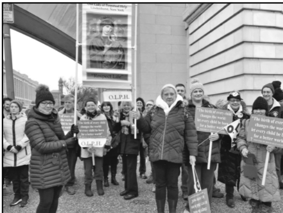
Our Lady of Perpetual Help, Lindenhurst

SAVE THE DATE: March for Life, Wash., D.C. Friday, January 24, 2020