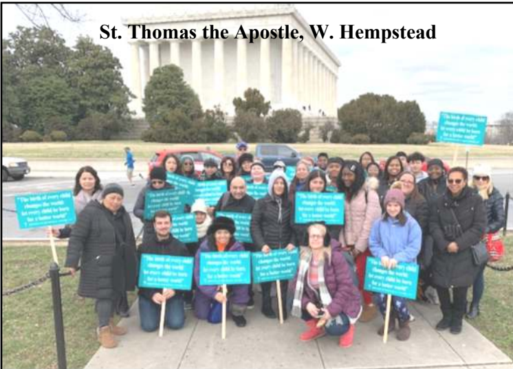
St. Thomas the Apostle, W. Hempstead

Thank you to all who went to the March for Life 2020 in DC and thank you to all who couldn't make the trip but participated in other local pro-life events and/or prayed wherever they were.