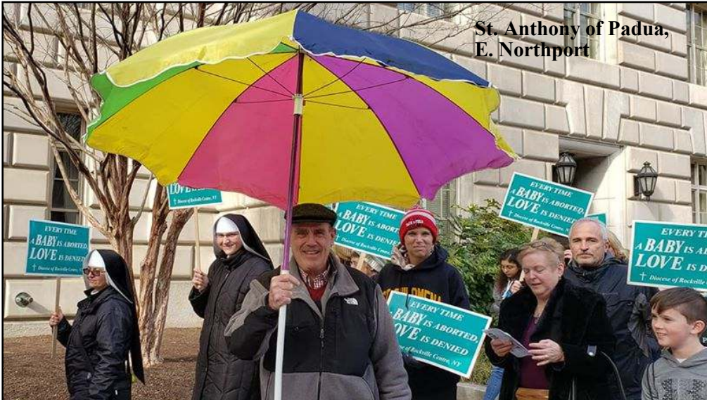
St. Anthony of Padua, E. Northport

March for Life NY Albany Monday, May 18, 2020 11 AM Opening Prayer at Children's Memorial inside the NYS Empire Plaza 11:30 March to the State Capital 12:30 PM Rally For more info Marchforlifeny.org