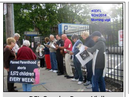
4oDFL Opening Prayer Vigil

In front of Planned Parenthood, 540 Fulton Ave. (Rt. 24, Hempstead Tpke.), Hemp-