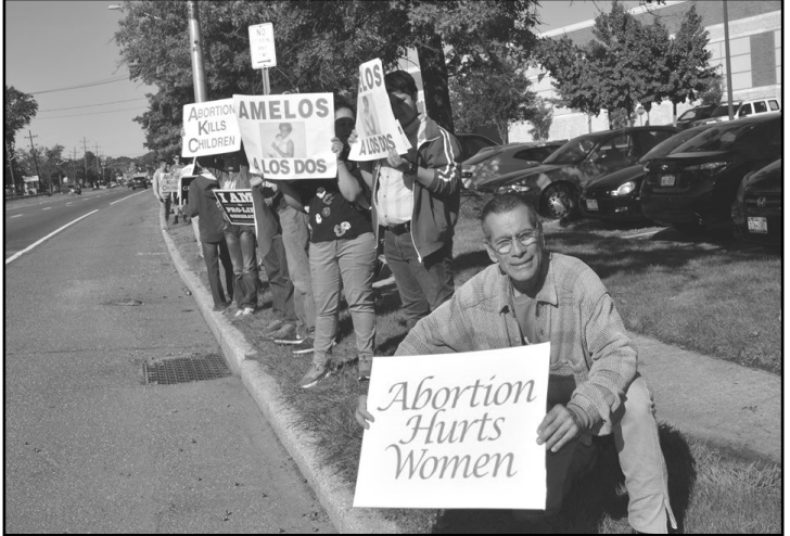
SUFL, Huntington