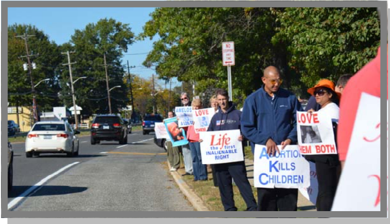
Signs will be distributed at both locations.

SUFL, East - LIE, Exit 70S, Cty. Rd. 111 Manorville, LI