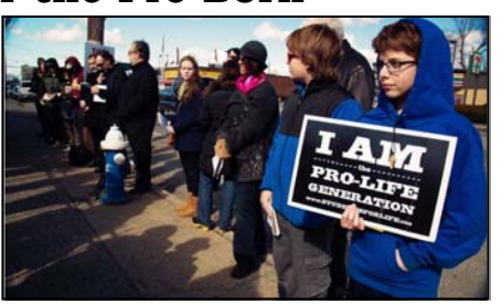
Holy Saturday 2015

Sat., March 26 10 AM in front of Planned Parenthood, 540 Fulton Ave., (Rt. 24), Hempstead. Sponsored by Cathedral Church