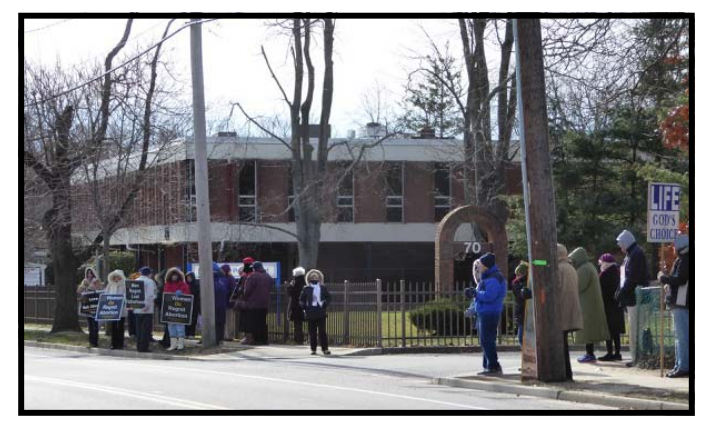
Prayer Vigil in front of Planned Parenthood, Smithtown on January 22, 2015.

Neither rain nor snow nor sleet nor hail - no we aren't talking about the USPS, we're talking about the dedicated pro-life people around our Nation and those shown in the photos below.