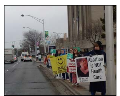
Good Friday 2015

March 25, 10:30 AM -Noon (rain or shine) in front of Nassau University Medical Center (2201 Hempstead Tpke., East Meadow). Pro-life women, men and children take part in this peaceful vigil for the protection of